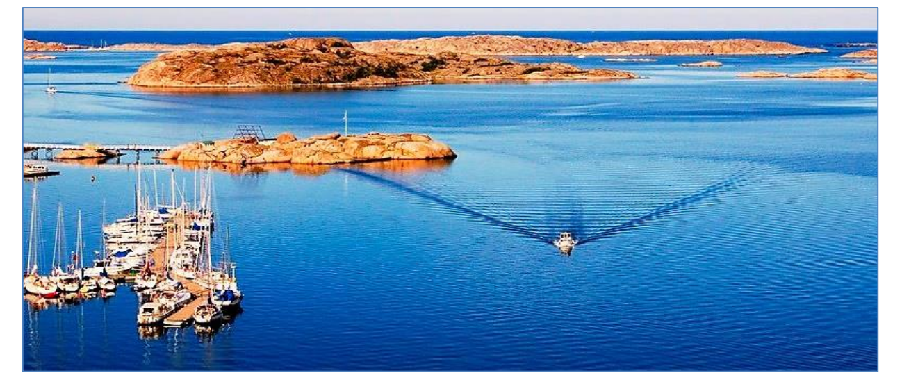
100 % Scandinavia: The water landscape around Marstrand Sat 05 September 2020 ⇒ Sat 12 September 2020

Experienced sailors and Scandinavia enthusiasts consider the western Swedish archipelago to be the most beautiful part of the Baltic Sea. The 'maritime adventure playground' off the coast of the Swedish provinces of Västergötland and Bohuslän has a diverse landscape, is well protected, visually unique, attractive, and at times can be fairytale-like and dreamy. Join us on an extraordinary discovery tour and travel this magnificent seascape in an unusual, yet pleasantly comfortable way: on board a traditional tall ship that is over 100 years old!