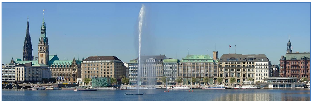
Panorama of Hamburg with town hall tower, Jungfernstieg and Inner Alster

On arrival in Hamburg, the Hanseatic city will still be dominated by the recently celebrated 829 th anniversary of its port. Take your time to explore the Hanseatic heart of Hamburg. Spring is now luring locals and tourists out to eat ice cream at the Inner Alster and stroll through the 'Planten un Blomen' park.